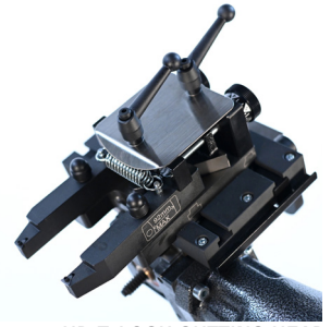
HD T-LOCK CUTTING HEAD