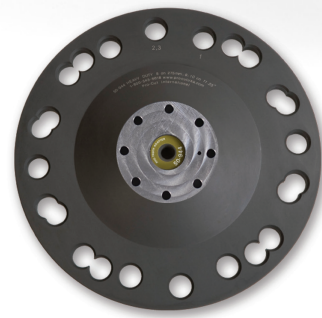
50-3944 MD Front Adapter 10 X 11.25" and 8 x 275mm