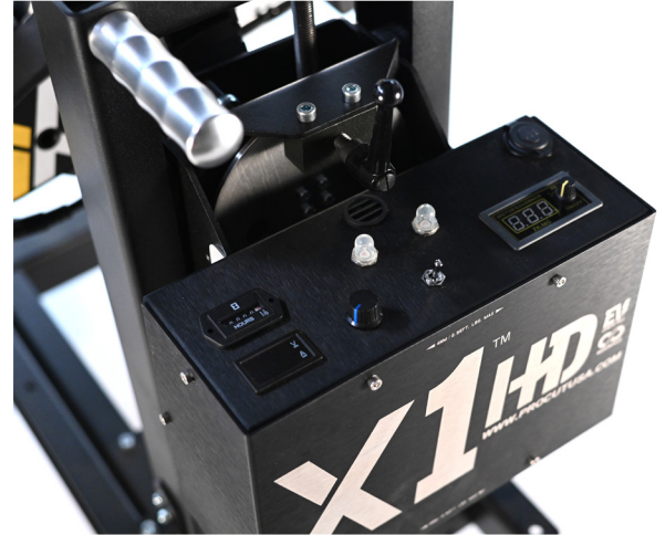
Separate DC spindle speed and feed motors with easy reset over current protection.