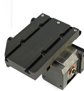
LOW MAINTENANCE GEAR BOX