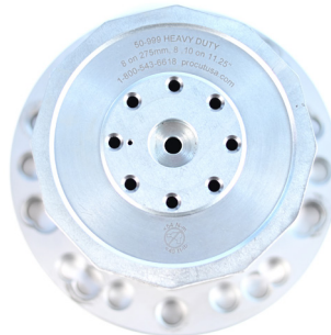
50-3999 MD Rear Adapter 10 X 11.25" and 8 x 275mm