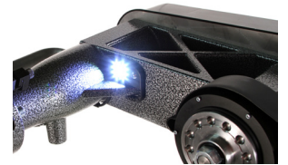
6 LED ON-BOARD WORK LIGHT & LIGHT- WEIGHT "X" BODY