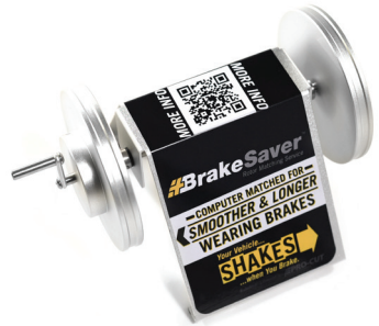
Free point of sale marketing program included!