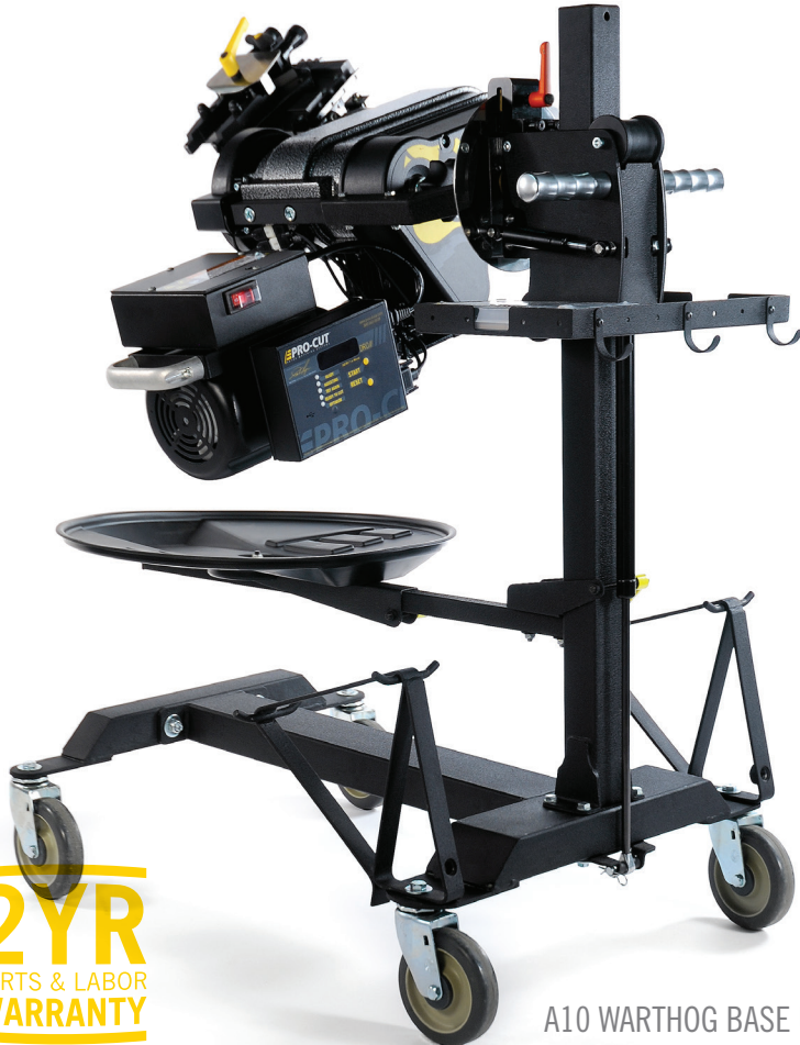
A10 WARTHOG BASE UNIT