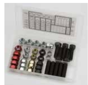
50-179 Lug Nut Kit

Contact the Pro-Cut Service Department at 800.543.6618, Prompt #2, with any questions.