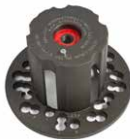
50-681 R3 Adapter