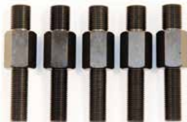
50-1011 Stand Off Kit