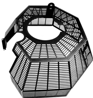
50-1740 (fits A10)

Pro-Cut would like to announce that the 50-944 (8 & 10 Lug Medium Duty Truck Adapter) will no longer be sold as a separate item. The 50-944 adapter will now only be sold with the appropriate guard ( 50-1730 for the 9.2 or 50-1740 for the Warthog), The new guard system helps protect the user when using the 50-944.